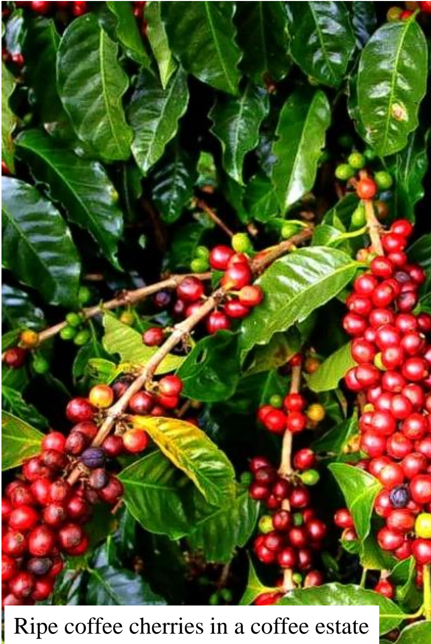
Ripe coffee cherries in a coffee estate