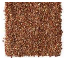
Ground flax seeds