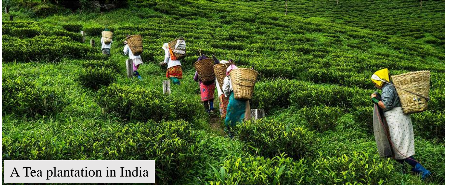
A Tea plantation in India