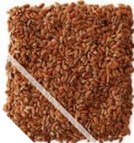
Brown flax seeds