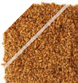
Golden flax seeds