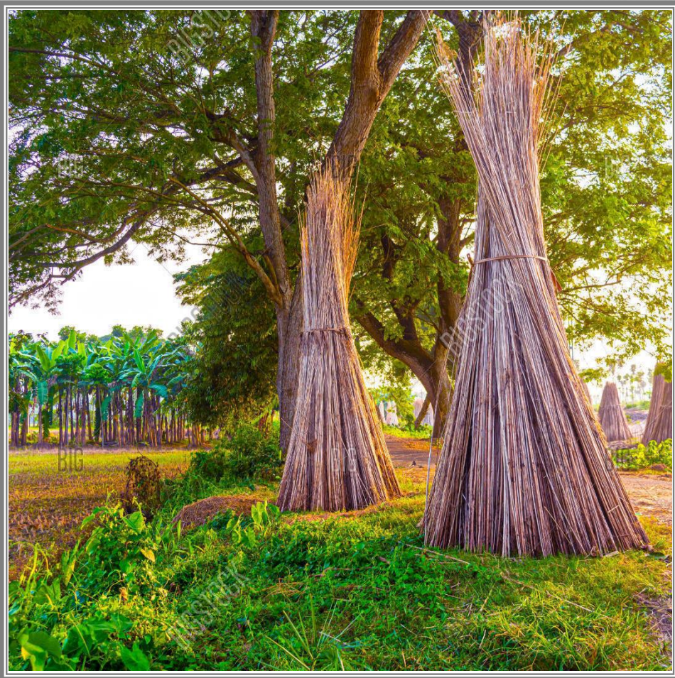
Jute cultivation in a field of West Bengal